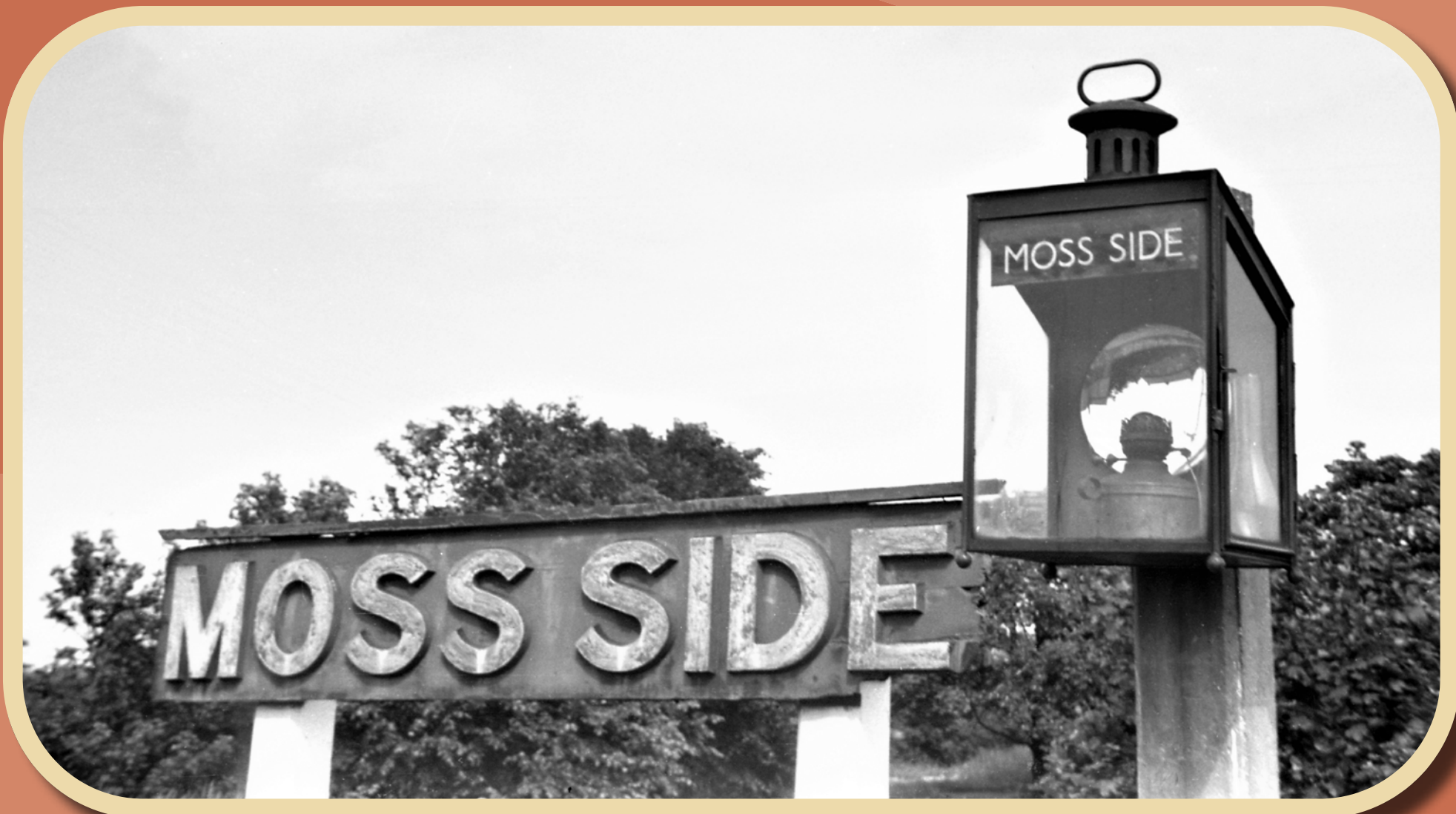
Weatherworn Moss Side Station Sign & Oil Lamp in June 1961