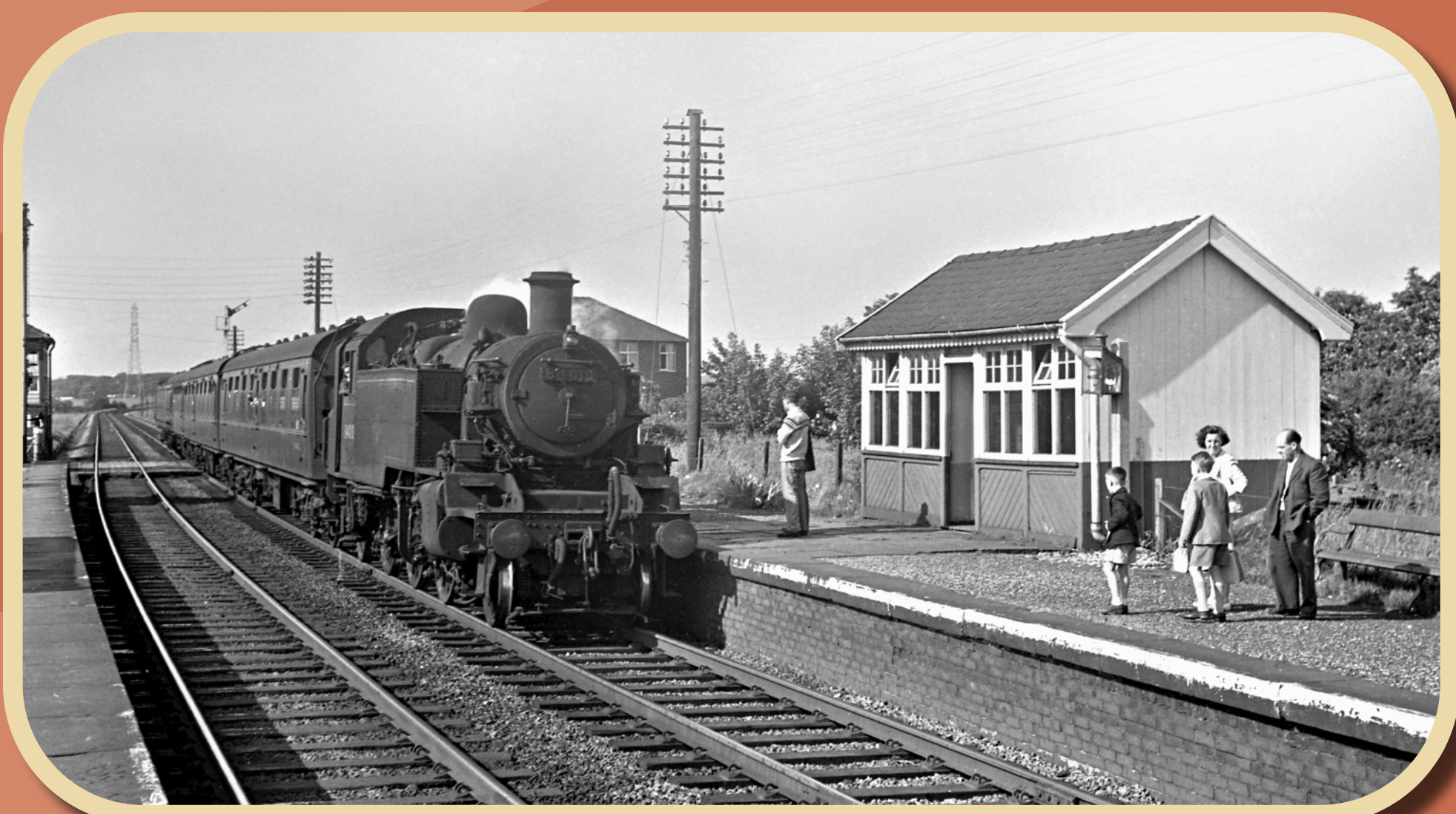
Last day travellers on the platform as 84010 arrives on the 4.50 pm train from Preston on 25th June 1961