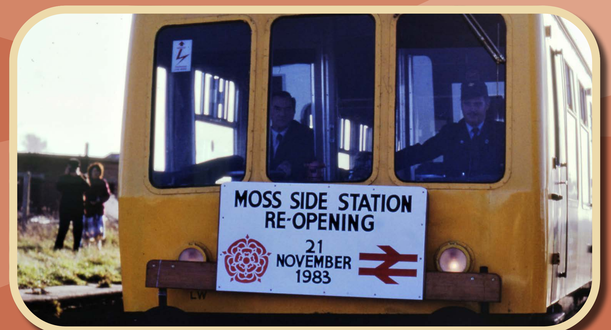
Moss Side re-opening train on 21st November 1983