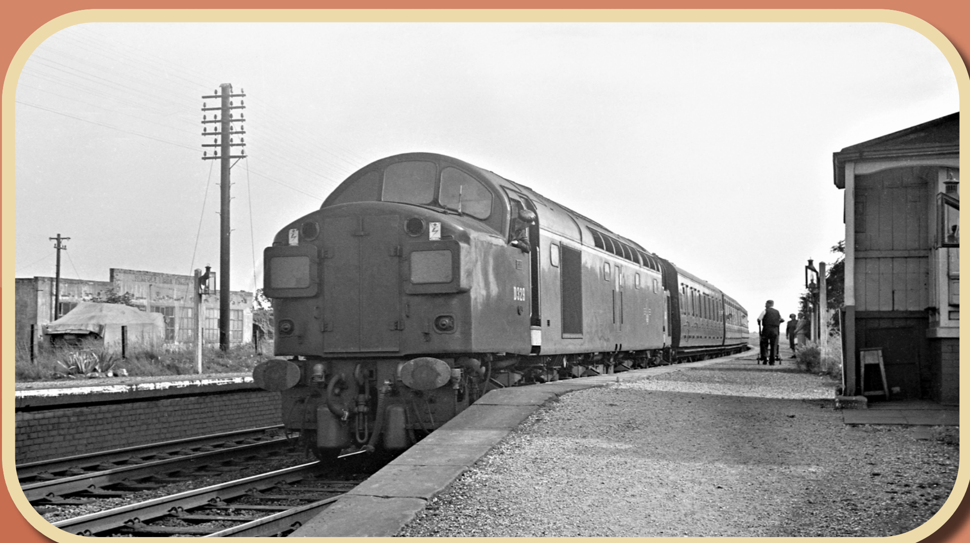
New English Electric diesel D329 calls at Moss Side on 25th June 1961