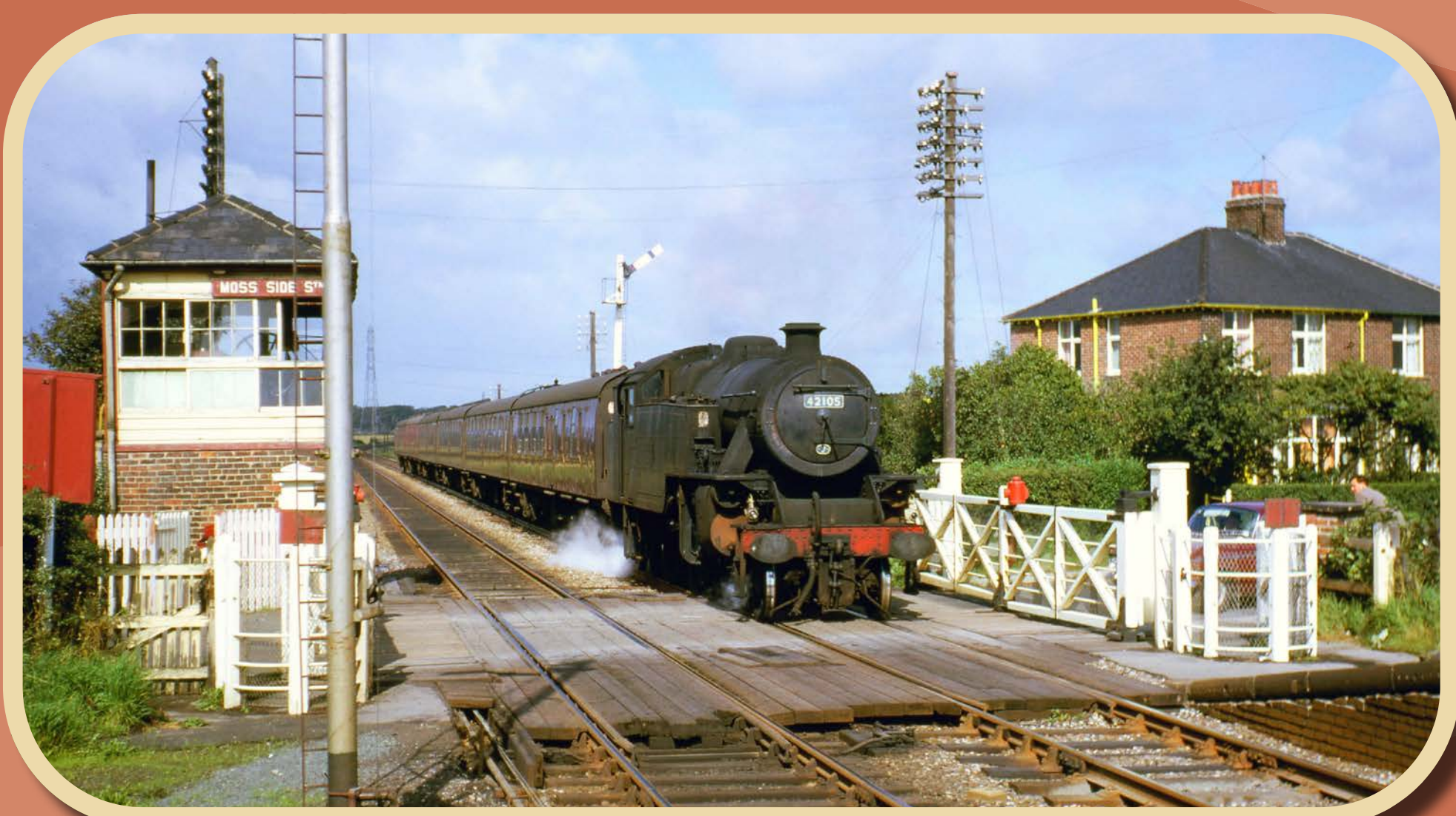
Lostock Hall shed's 2-6-4 tank 42105 passes Moss Side on 13th September 1966 on an express from London