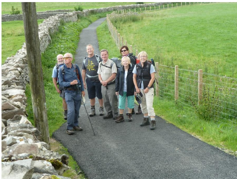
DalesRailers taking the concessionary path from Kirkby Stephen station to the town.

So, take DalesRail to Kirkby Stephen station where you alight! Take the concessionary path into the town and head for the Market Square. From there take the footpath to Hartley crossing over the lovely Franks Bridge on your way. Passing through Harley and taking the road that heads towards Hartley Quarry and the Nine Standards you will come to a path that starts more or less at Merrygill Viaduct.