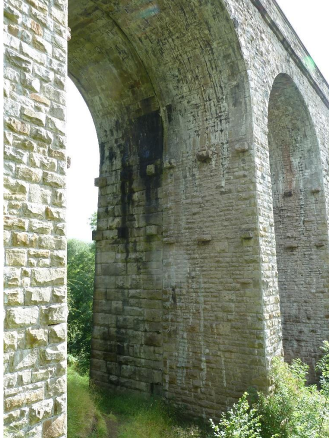
Podgill Viaduct showing clearly the original (left) and later extension (right)

Both Merrygill, 9 arches, and Podgill, 11 arches, were originally built to carry only a single-track line but were widened in 1889 to carry two tracks. The different styles are easily seen at Podgill where a short path takes you down so you can see beneath the viaduct.