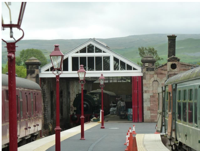
Kirkby Stephen East station

The line ends at the new Millennium Bridge which is close to the dramatic Devils Mustard Mill. If you head towards the main road through Kirkby Stephen close to what was the Croglin Castle Hotel you come to Kirkby Stephen East station. The station is being looked after by volunteers of the Stainmore Railway Company and is generally open on Sundays during the DalesRail season. Well worth a visit and you may be lucky and trains will be running!