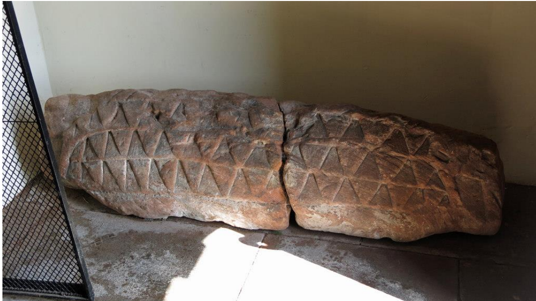
9 th Century hogback Viking gravestone at St Michael's Church, Addingham

Now turning south along pleasant footpaths, we come to old Parks and see the Romany bird table memorial. Continuing to Glassonby we go south and visit the Anglican Church of St Michael, this is also known as Addingham Church, the village of Addingham no longer exists, it was washed away centuries ago when the River Eden changed its course. Inside the church are the unlikely remains of a Viking hogback gravestone. Well worth taking time to have a look at this. Going on we come to the stone circle of Long Meg and Her Daughters, resting there for a short break before going on to Little Salkeld Mill for refreshments if necessary. From Little Salkeld Mill due allowance must be made for the distance of 2 miles to Langwathby station and the train home.