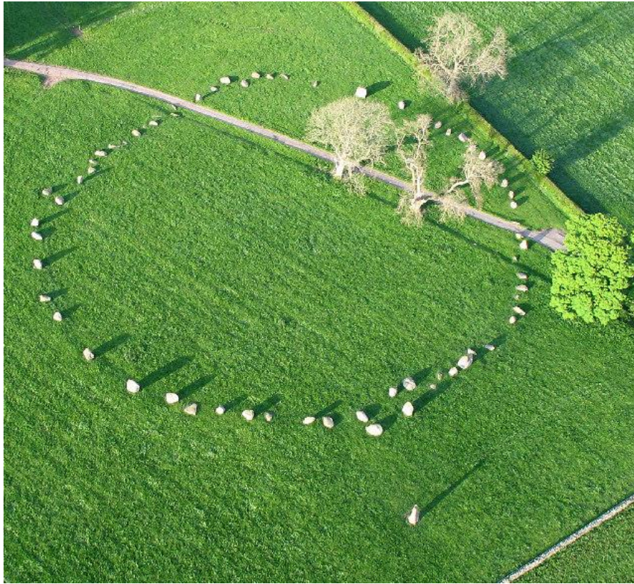
Aerial view of Long Meg and Her daughters

Here is an easy walk of 8 miles going south to Langwathby.