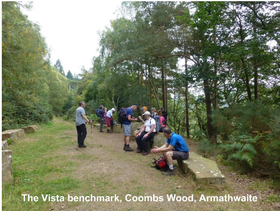
The Vista benchmark, Coombs Wood, Armathwaite

Armathwaite has an annual garden festival which features in the DalesRail programme.