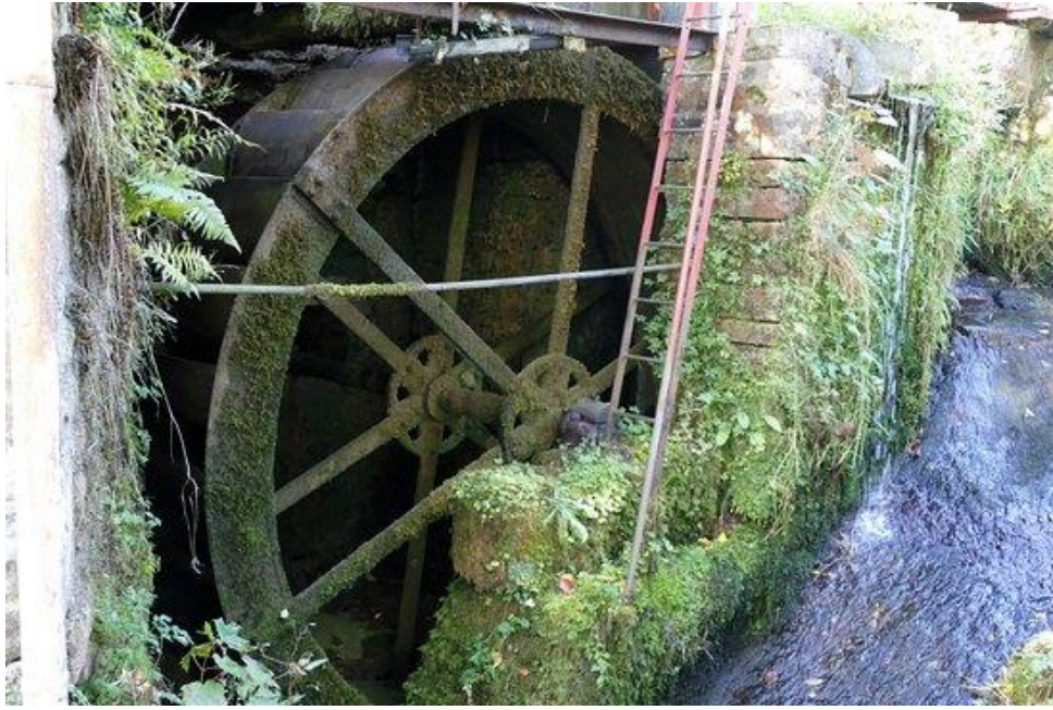
Little Salked Mill

For more information about Long Meg and Her Daughters use the links below: