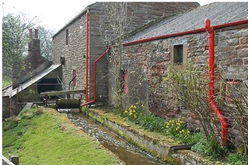
Little Salkeld Mill

Please note that at the time of writing the tearoom is closed due to Covid-19. Check the website to see when it might re-open.