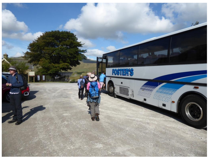
Extending the reach of DalesRail to Swaledale and Wensleydale.

Muker is the starting point for one of the many lovely walks I like to do in Swaledale and is accessed from one of the DalesRail coach connections.