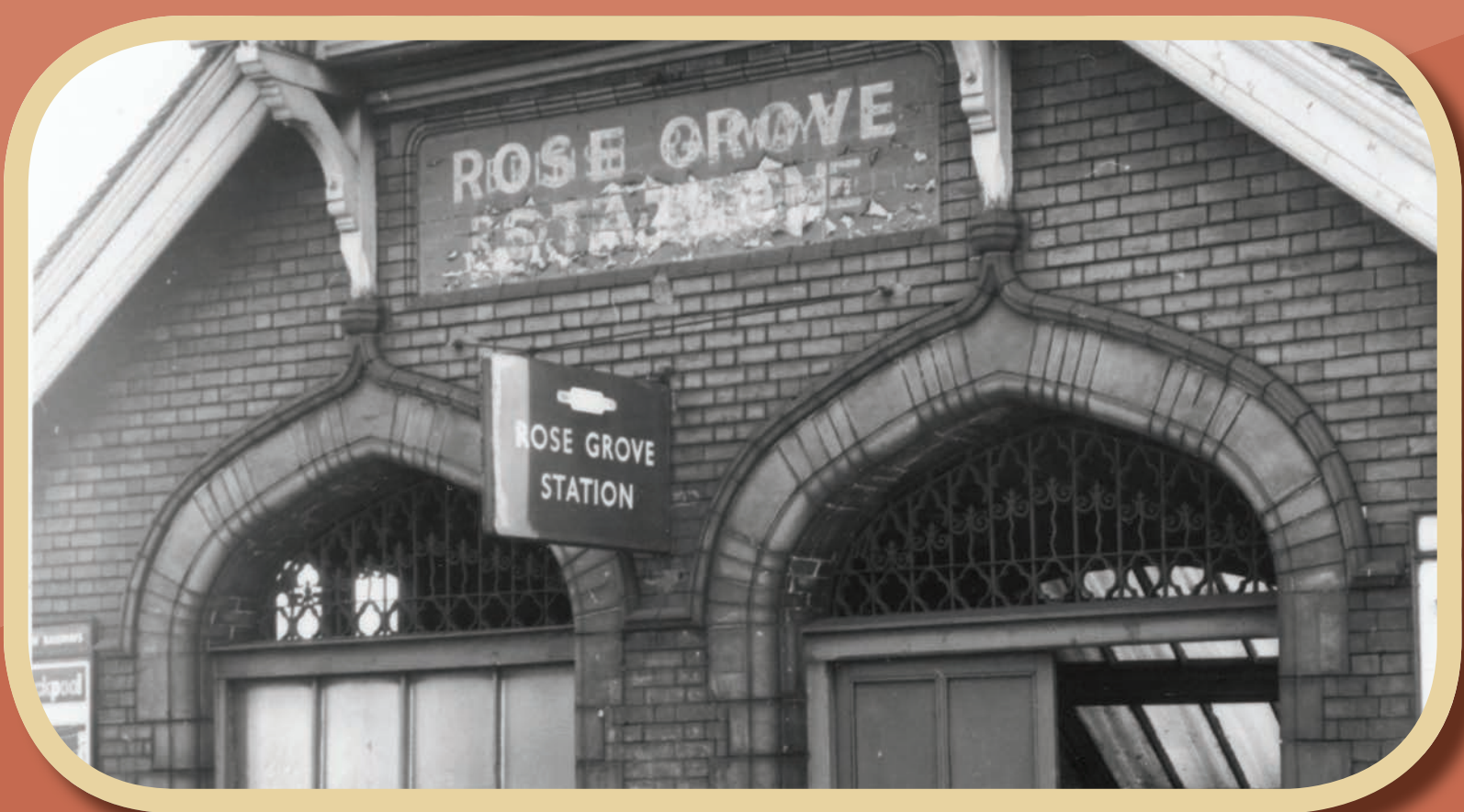
Rose Grove Station Entrance