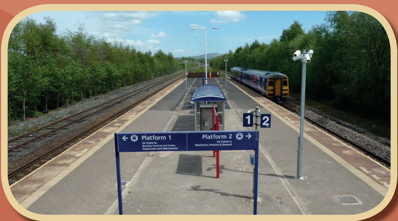
A unit approaches Rose Grove on 13th May 2015