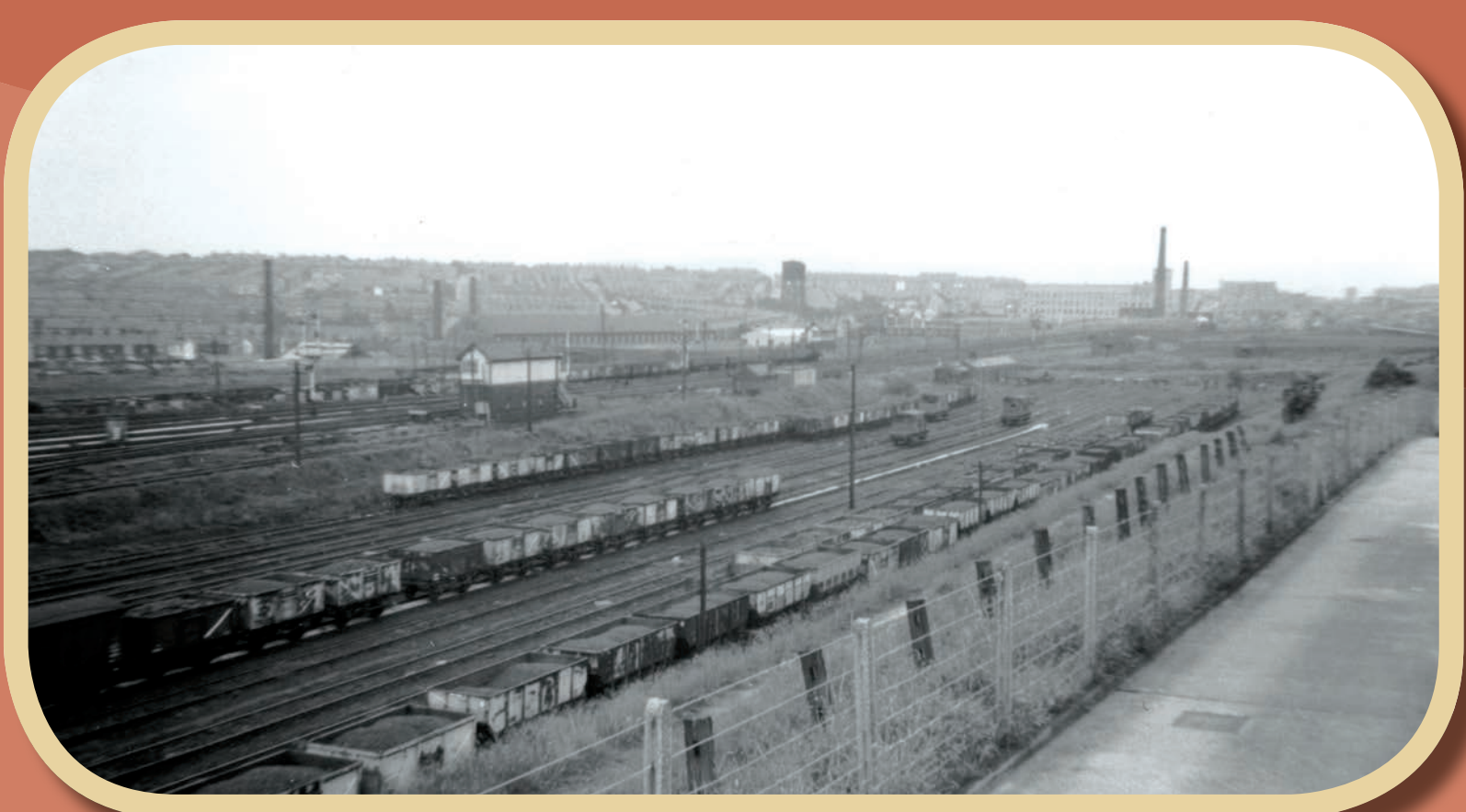
Rose Grove Yard