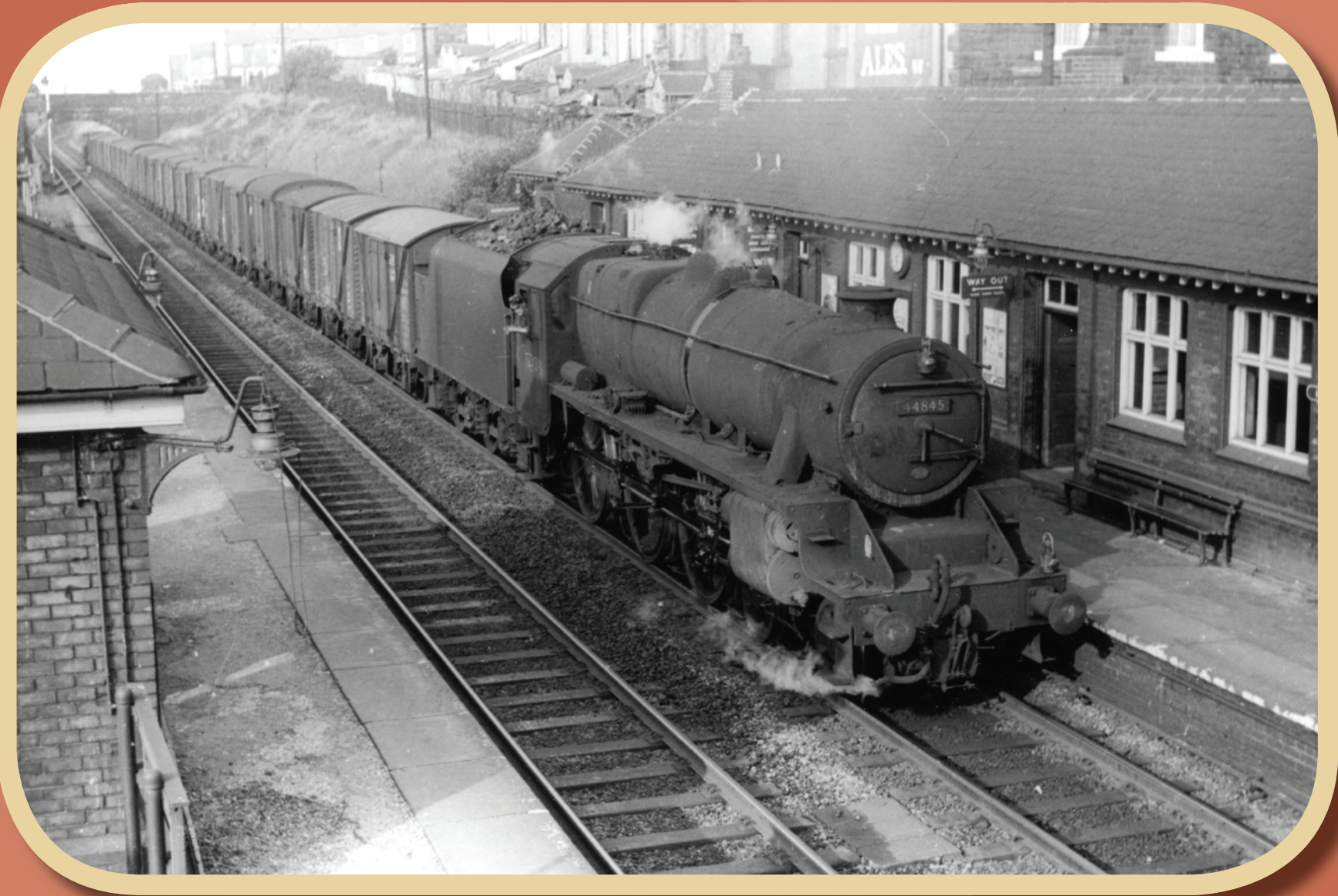
Black 5 44845 heads a freight through Huncoat Station - Early 1960's