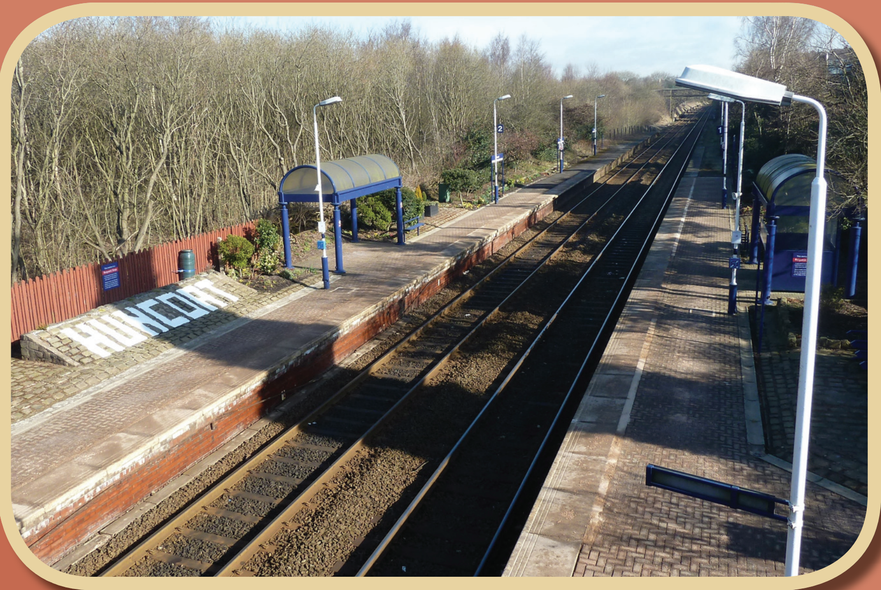
Huncoat Station March 2013

At the Huncoat end of the system the branch spanned Clough Brook on an eight arched viaduct. Immediately to the rear of the Burnley platform were large coke ovens - all rail served.