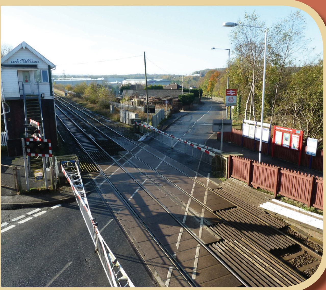
Huncoat Station Level Crossing - October 2012

By the early 1930s the three local collieries, Broadmeadow, Moorfield, and Whinney Hill; two coke works and the Nori Brick Works were all rail connected in a complex rail system that joined the main line at Huncoat and Within Grove. Part of the old embankment of this system can still be seen from passing trains.