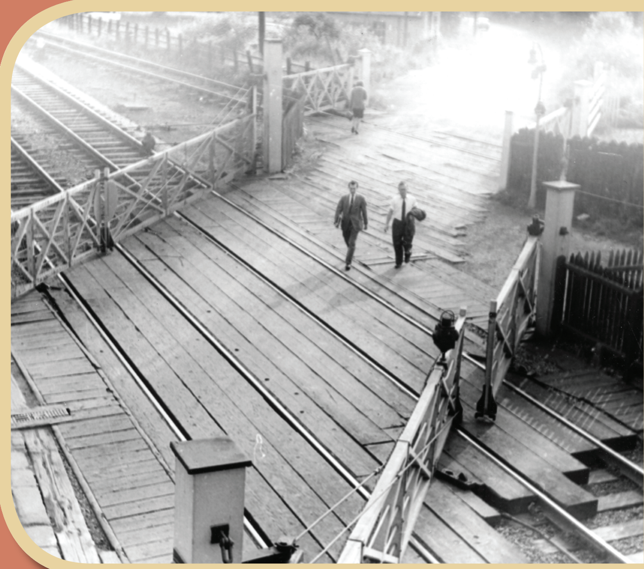
Huncoat Station Level Crossing - Late 1950's

In 1912 the station was virtually rebuilt and the neat brick station consisted of a porter's room, lamp room, and ladies waiting room with toilet, booking office, parcel office, general waiting room and outside gentleman's toilet.