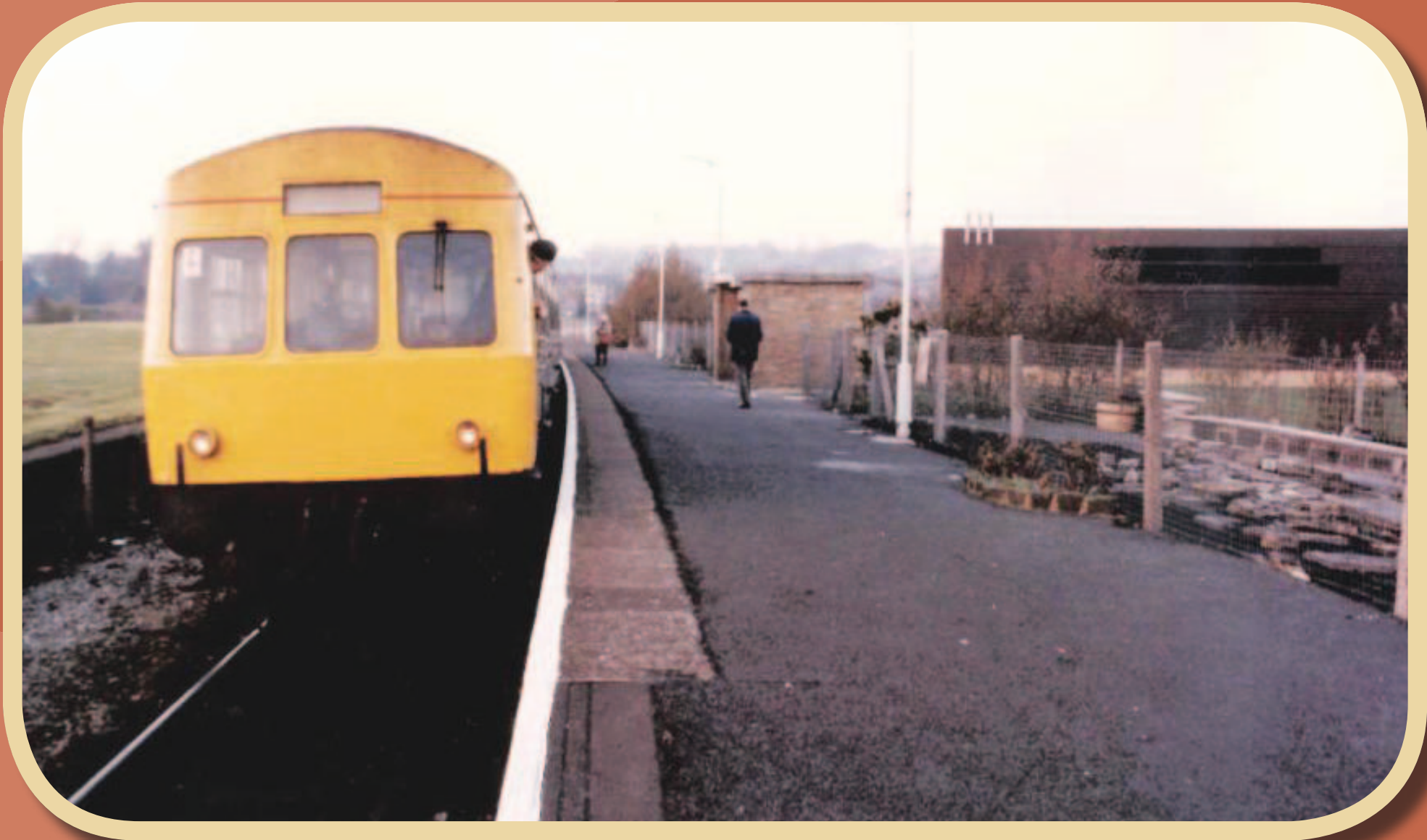
Colne station 1970s – photo courtesy Brian Haworth