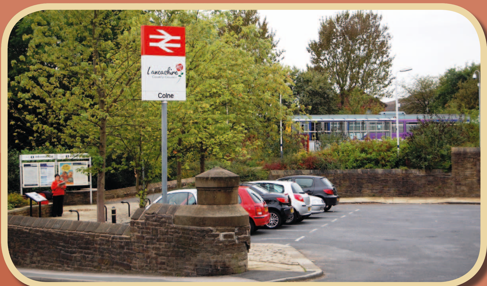
Colne station entrance 2009