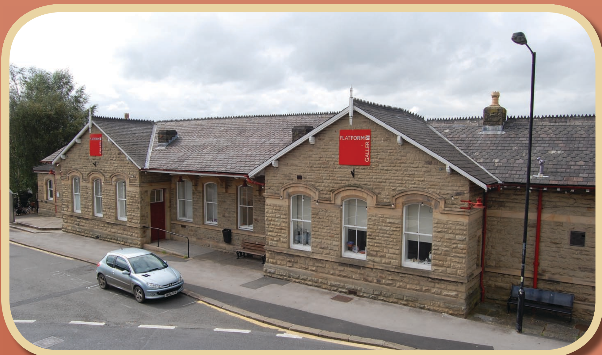
Clitheroe circa 2008