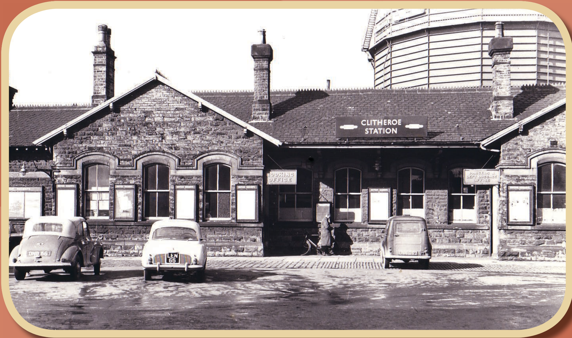
Clitheroe circa 1961