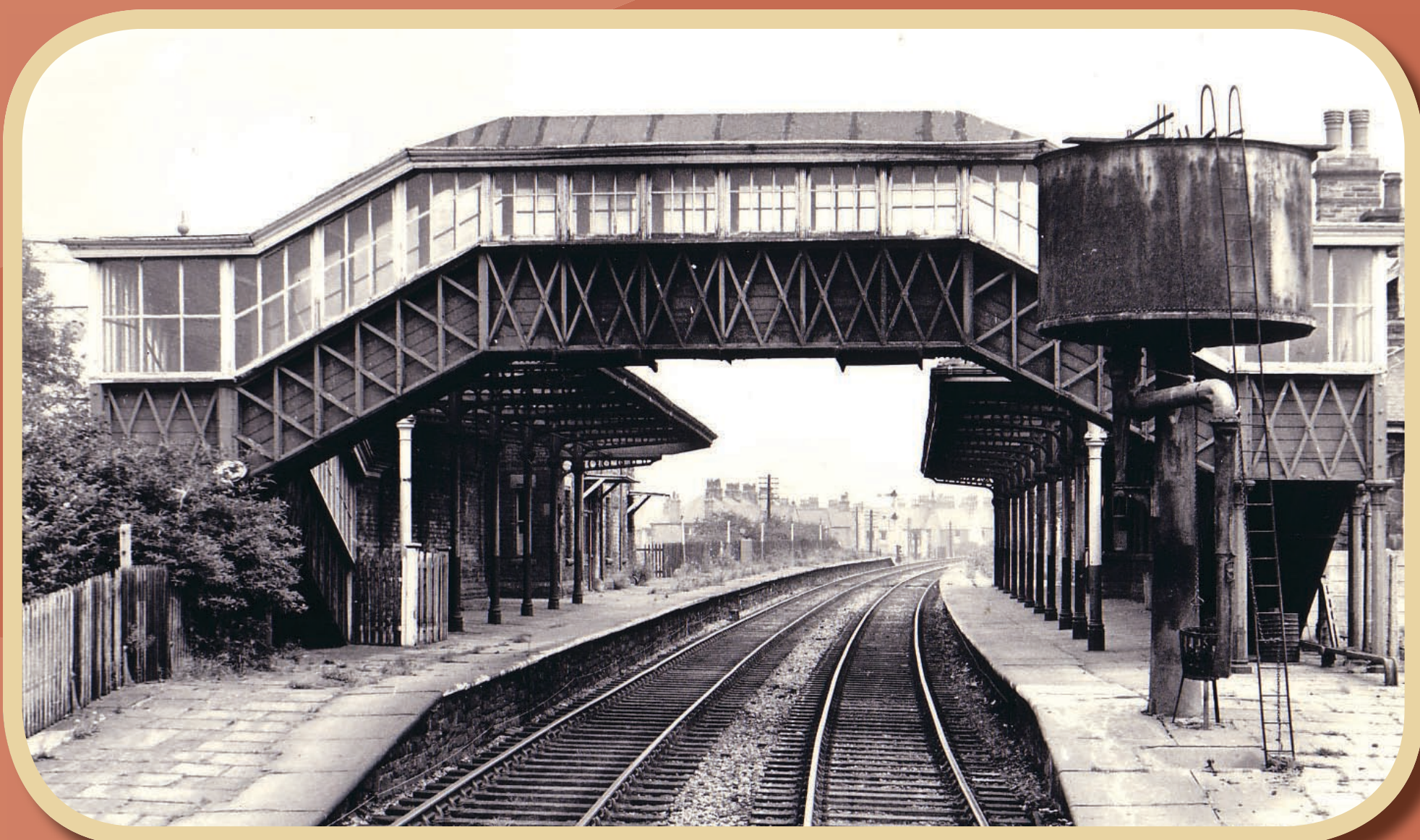
Clitheroe circa 1964