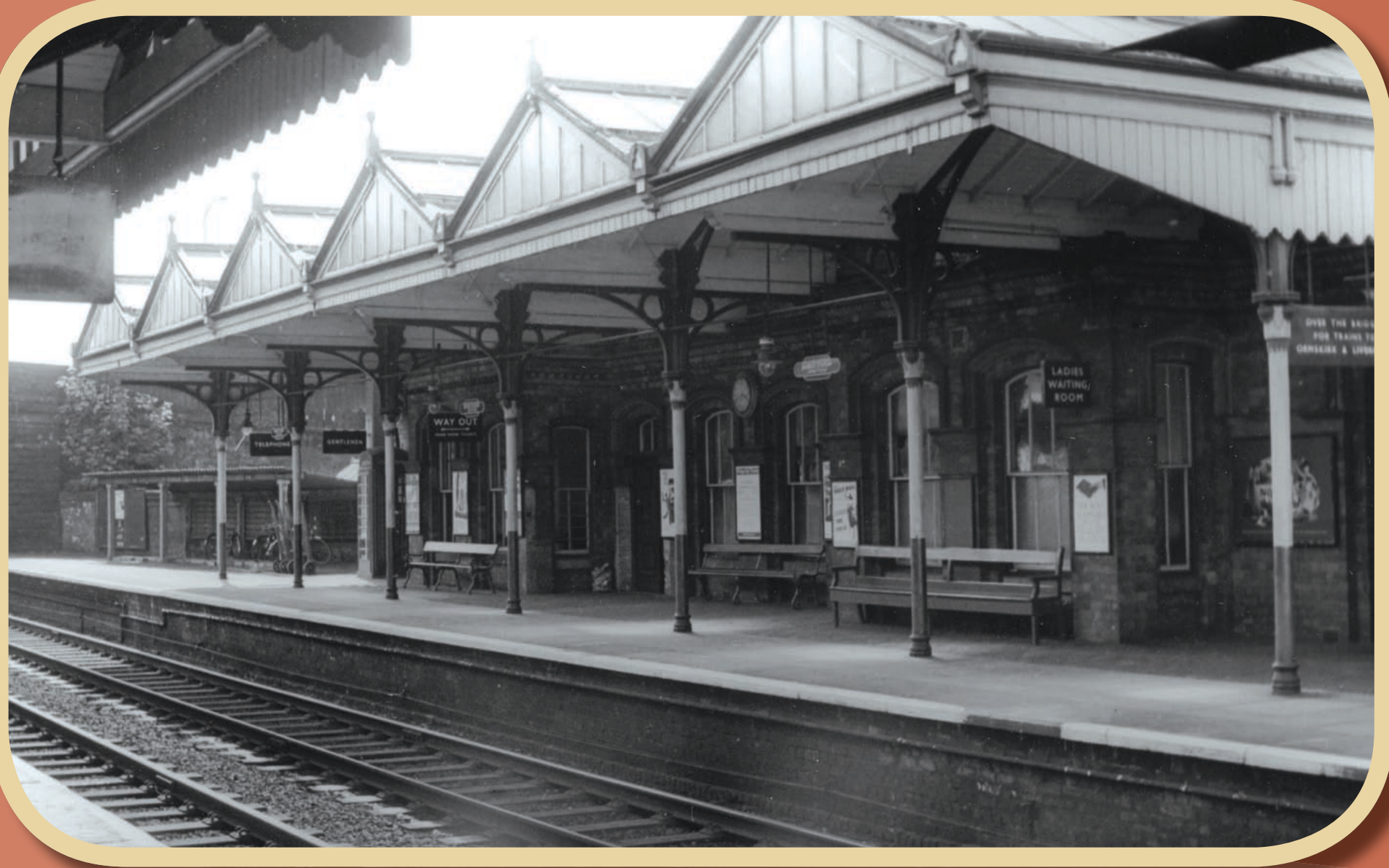
Burscough Junction in the 1950's