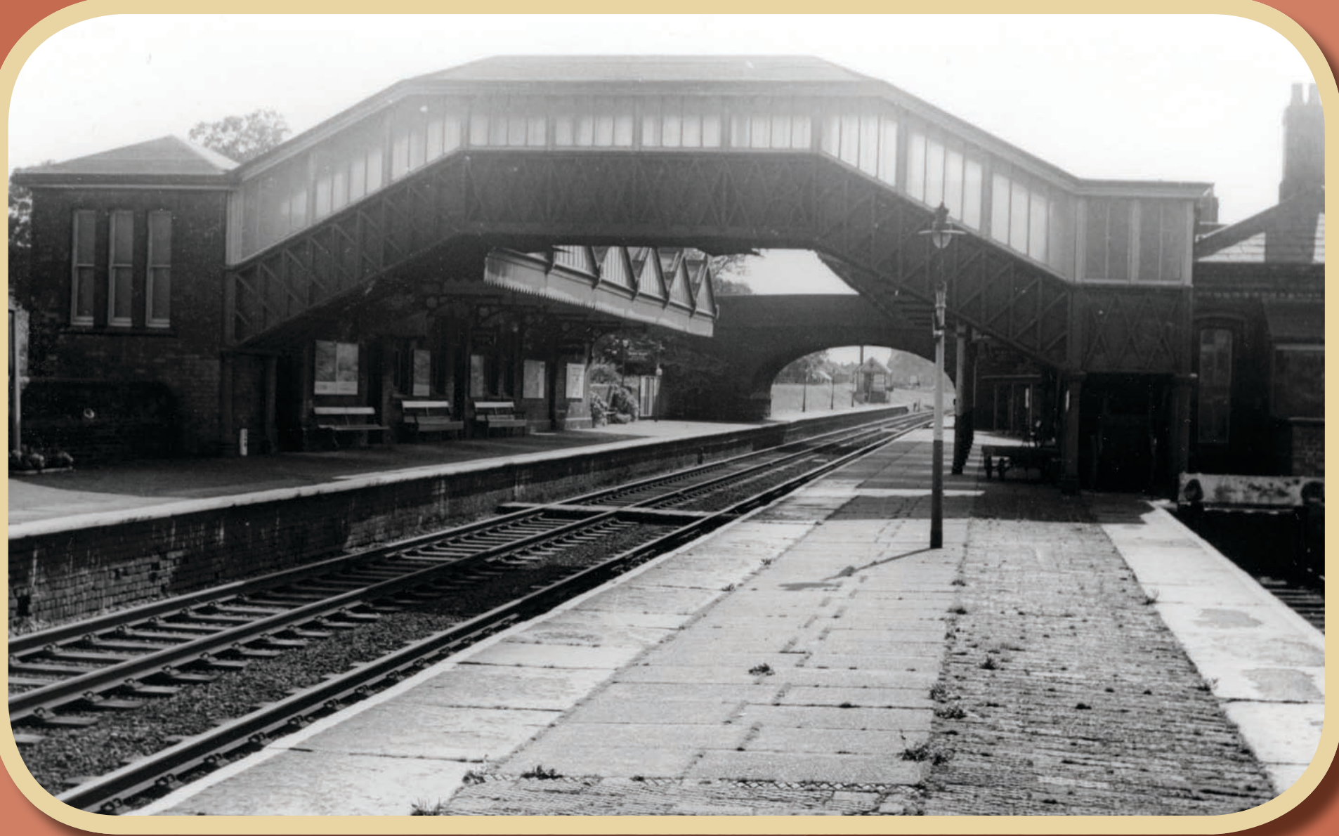
Burscough Junction in the 1950's