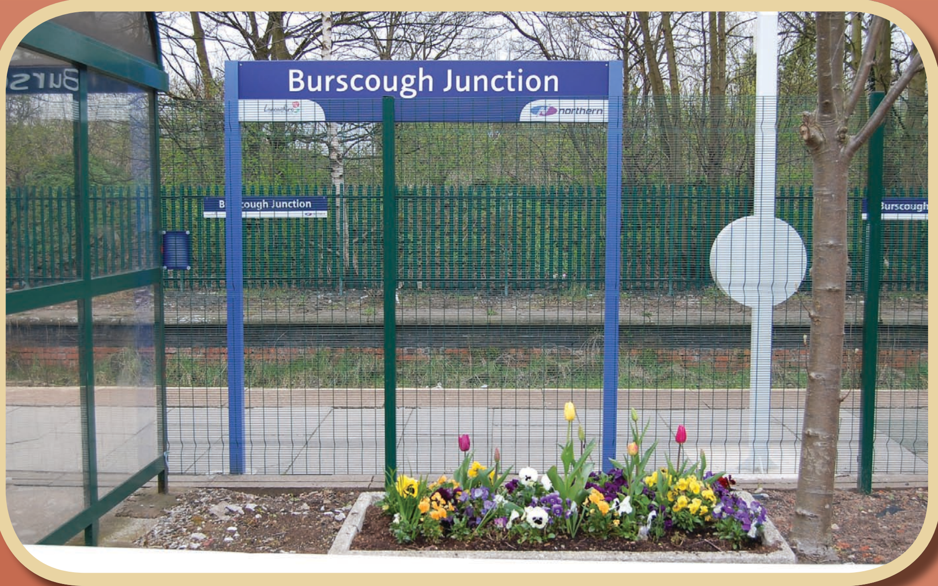
Burscough Junction in 2009

The Liverpool, Ormskirk and Preston Railway Company received parliamentary authorisation to build the line on the 18th August 1846. At this stage the East Lancashire Railway acquired the company and responsibility for the construction of the new line. It accepted a tender from McKenzie, Brassey and Stephenson for £200,698 on the 20th January 1847 and the first sod was cut near Maghull on 16th March 1847.