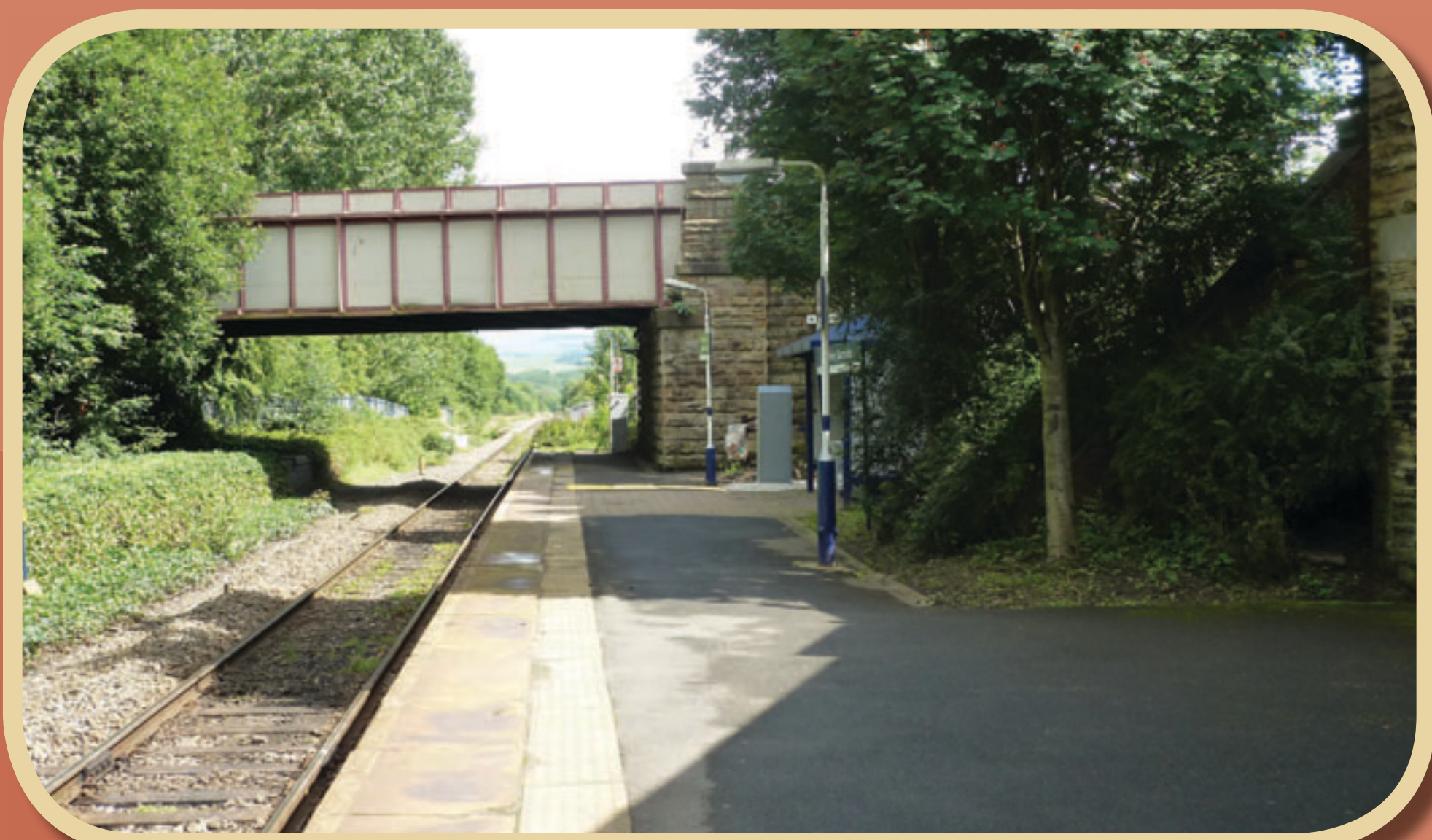
Burnley Barracks Station - August 2010