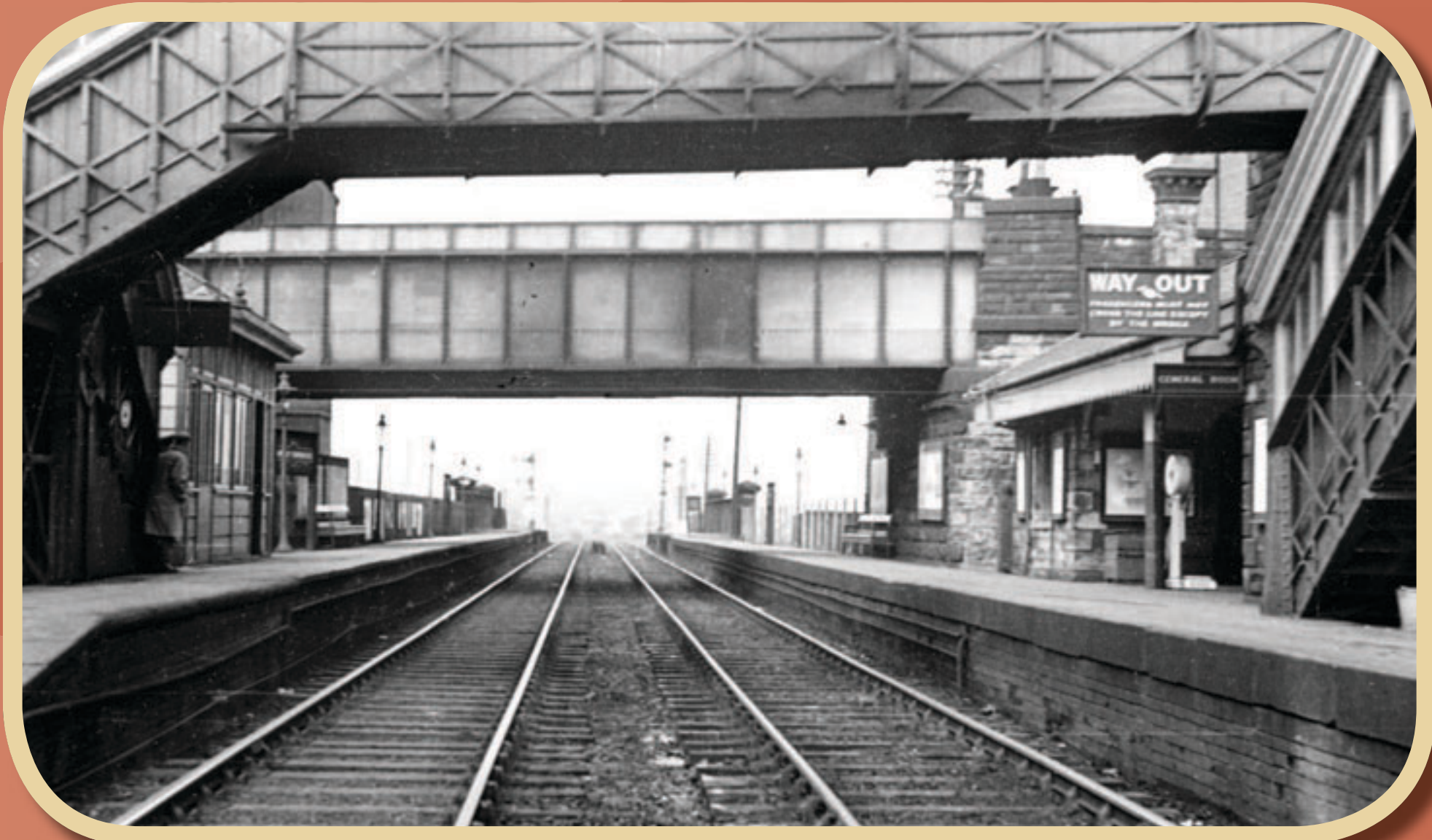
Burnley Barracks Station - photo courtesy LYRS