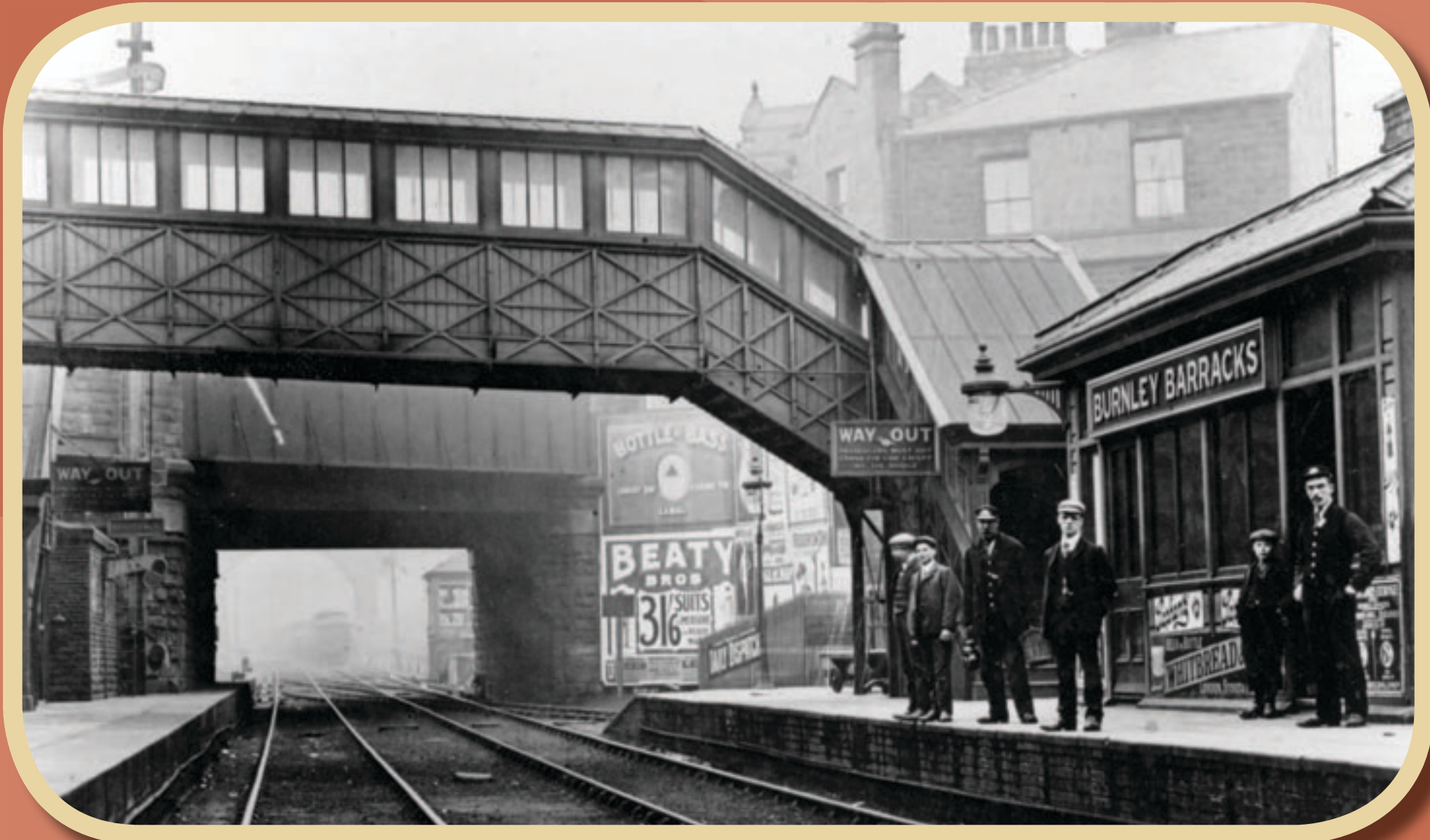
Burnley Barracks Station