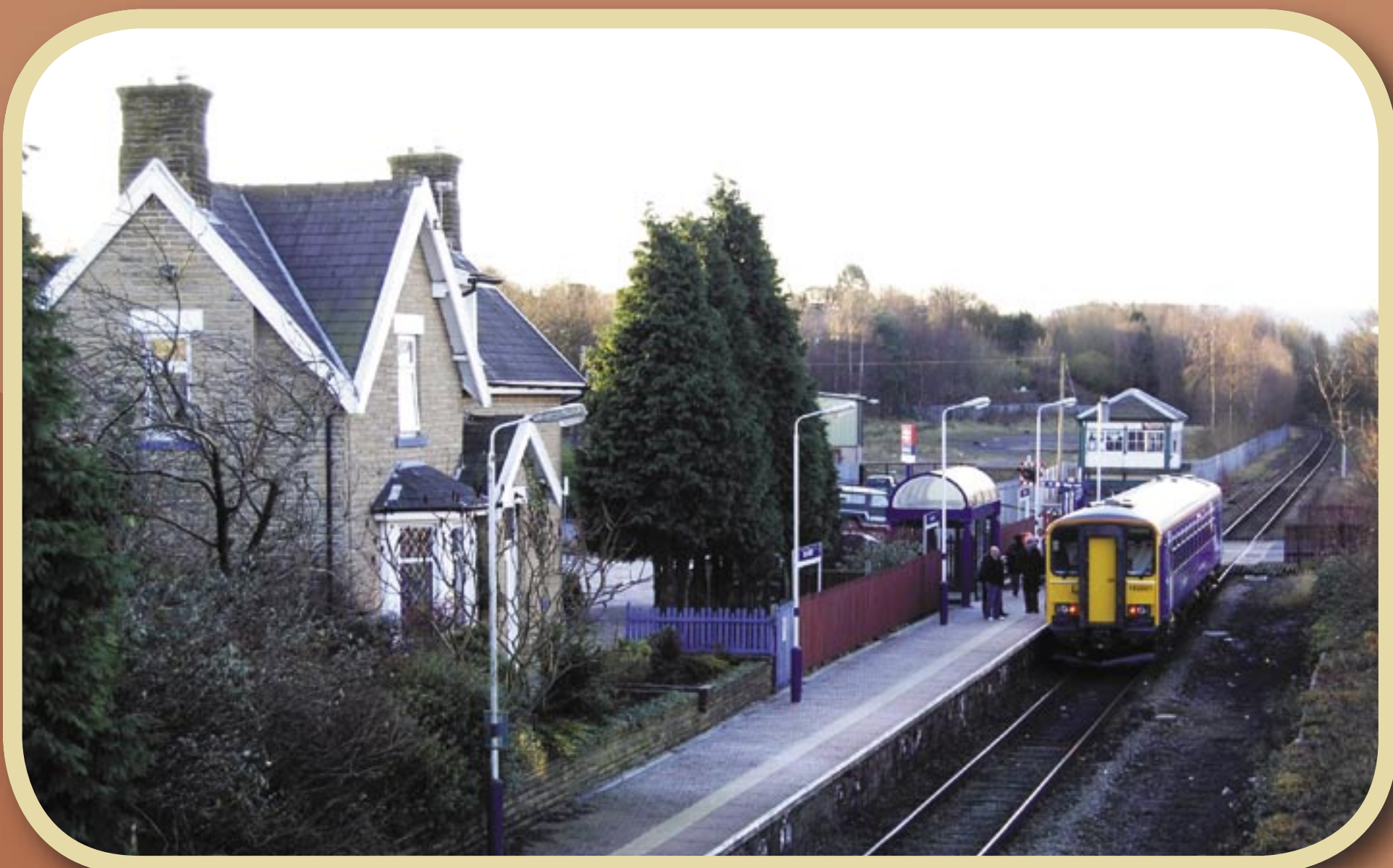
Brierfield 10th Dec 2007