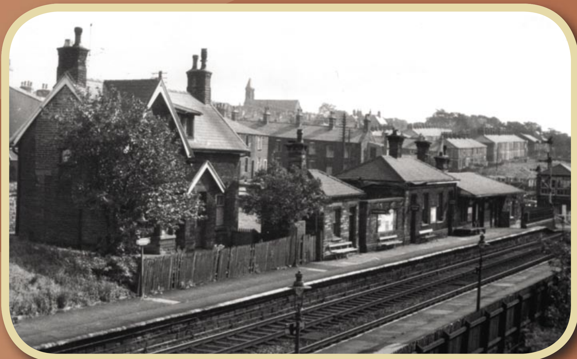
Brierfield circa 1965