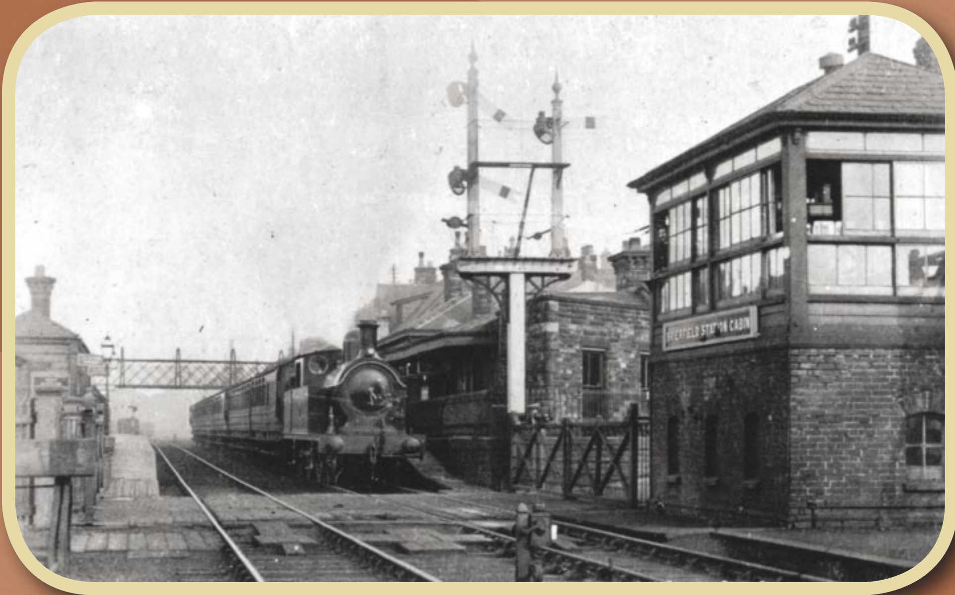
Brierfield circa 1910