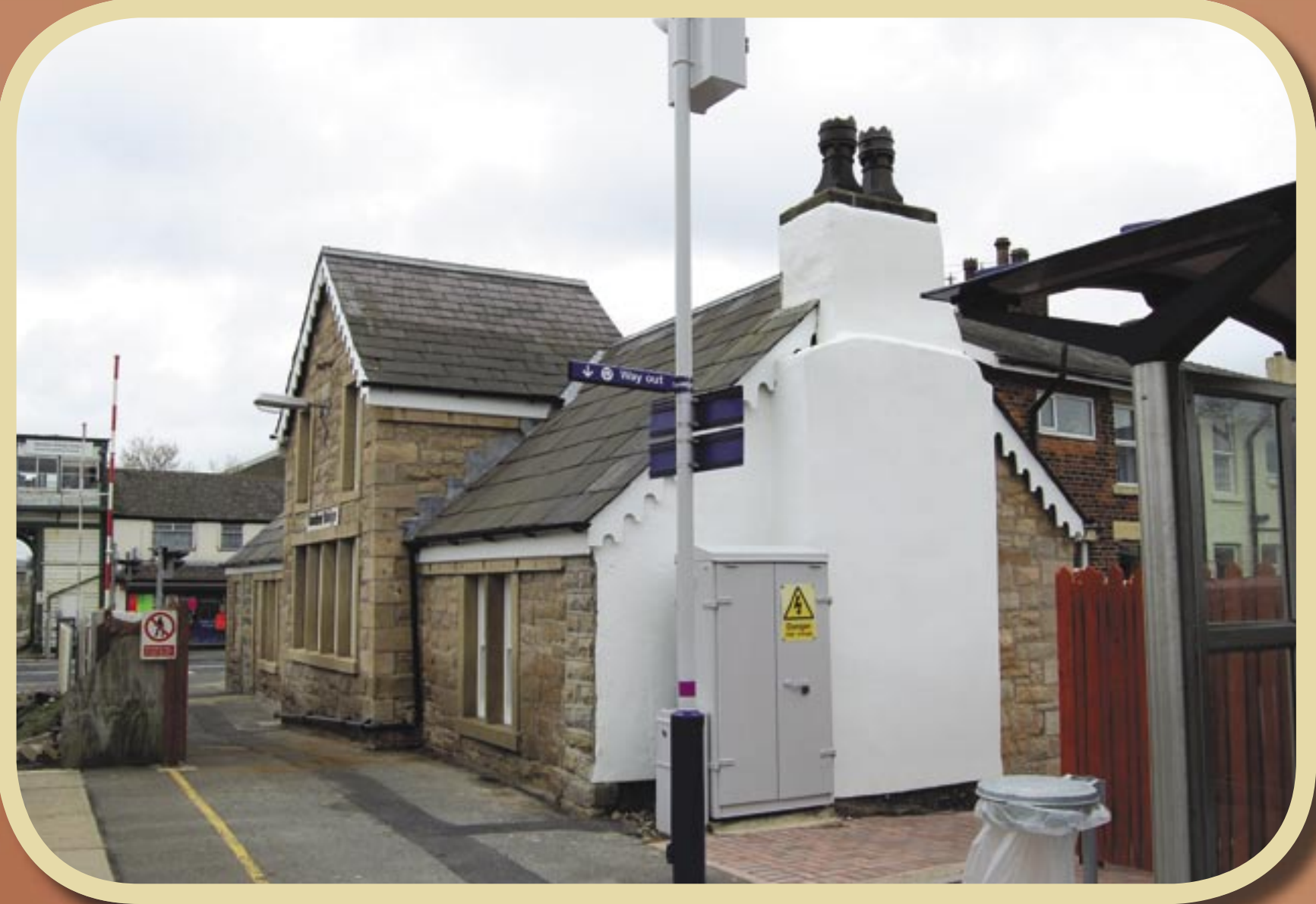
Bamber Bridge circa 2008 - photo courtesy Simon Clarke