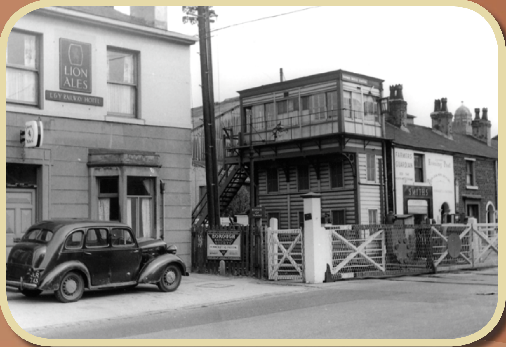
Bamber Bridge circa 1950s