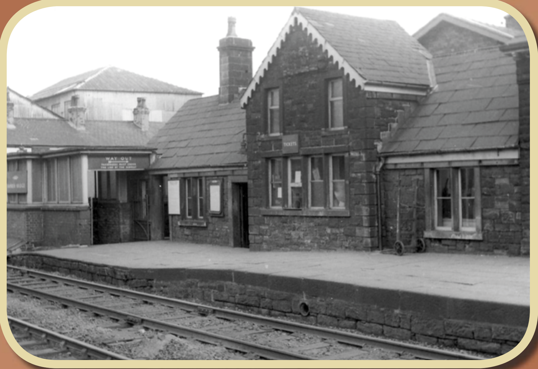
Bamber Bridge circa 1950s