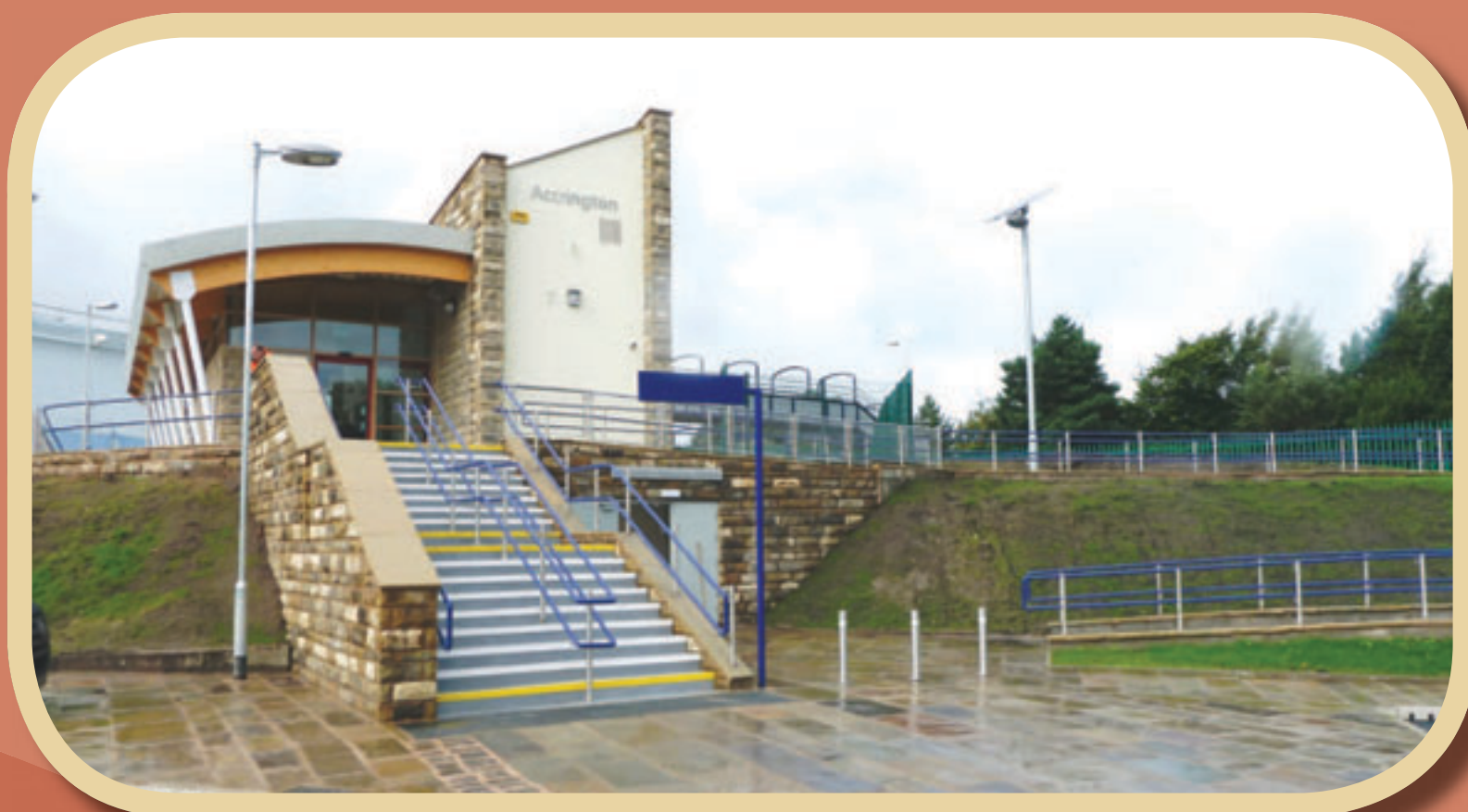
Accrington Eco Station - August 2010