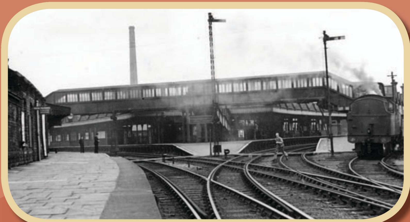
Accrington Station - General view looking south