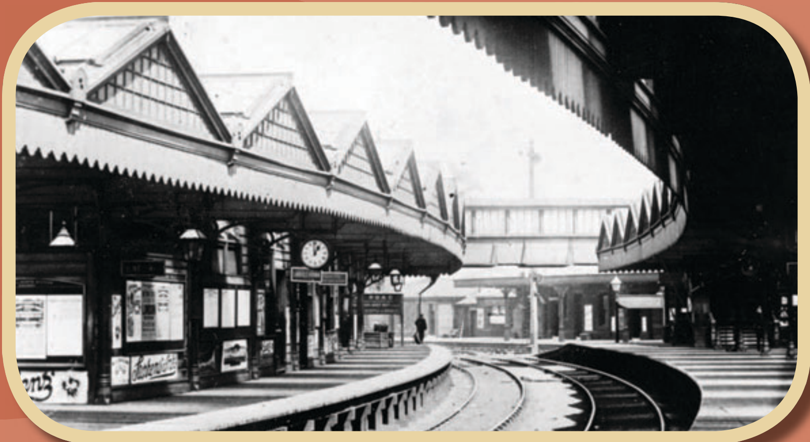
Accrington Station - General view looking north