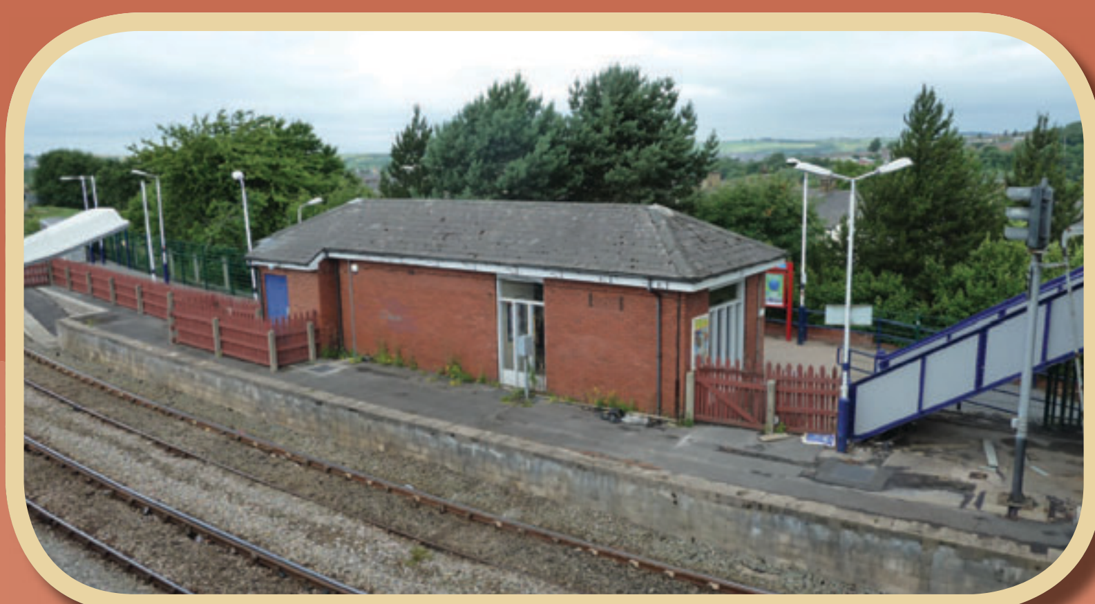
Accrington Station - July 2010