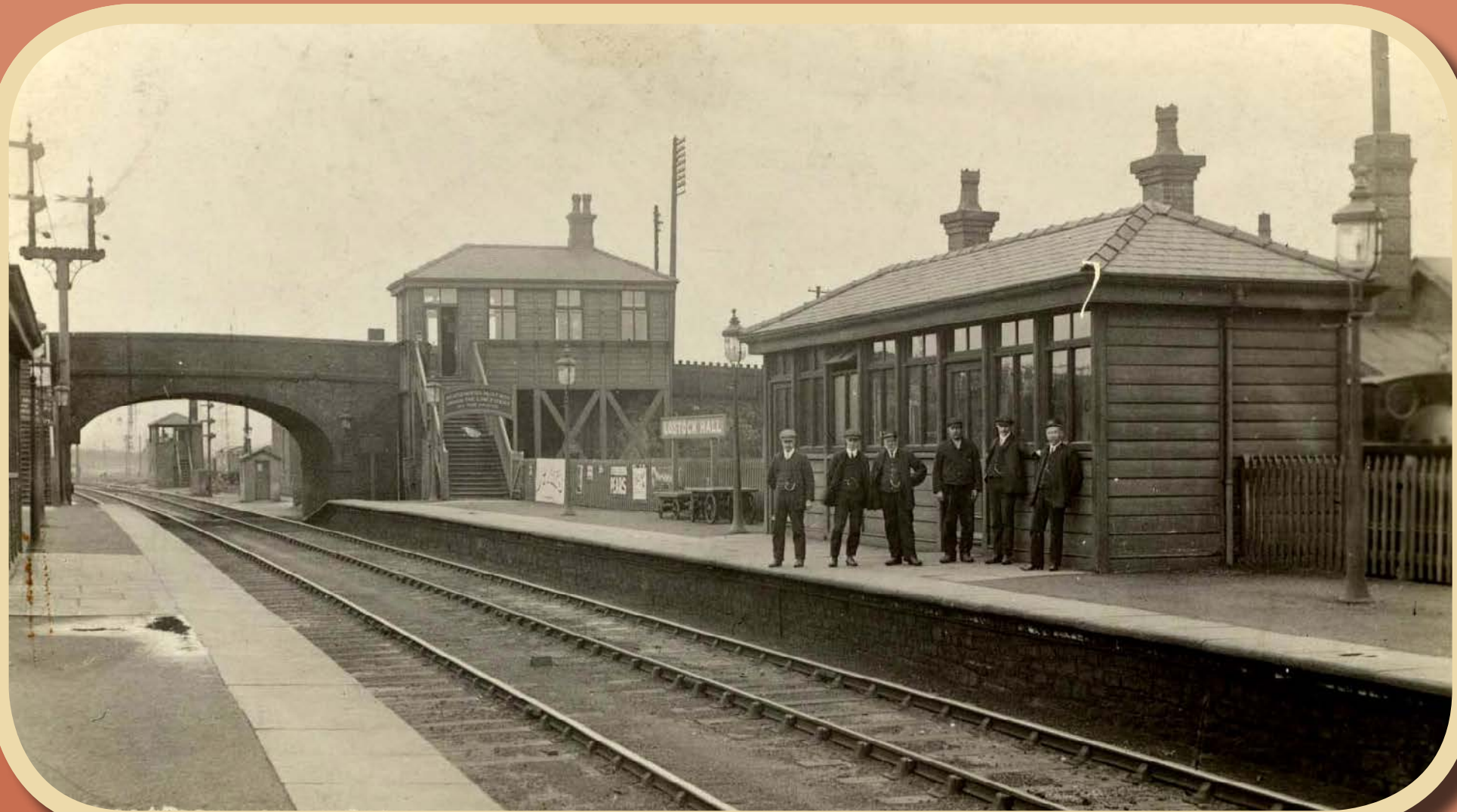
An early picture of Lostock Hall showing staff compliment.