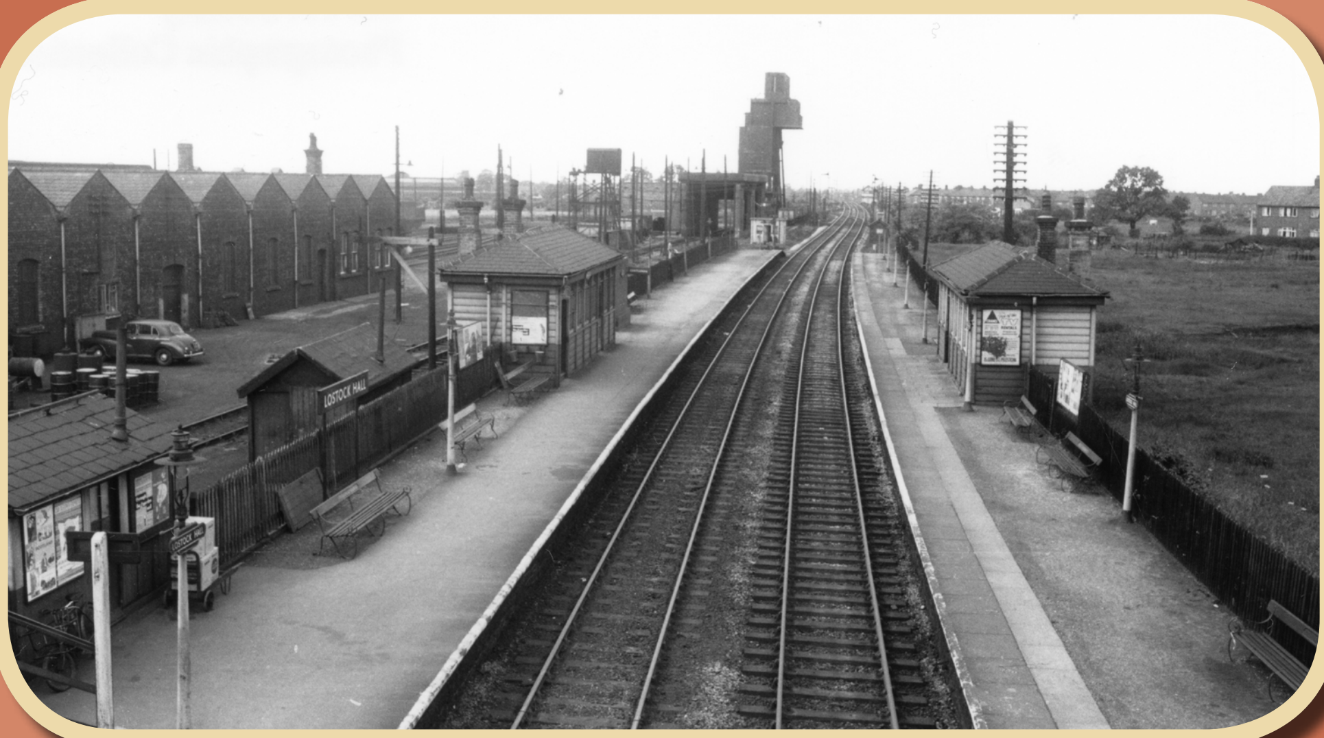
Lostock Hall Station – looking west in 1963.