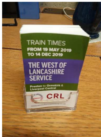
The mini timetable

CRL is developing a range of mini pocket-sized timetables for a number of its routes. To date there are timetables for the Todmorden Curve, west Lancashire, South Fylde and Clitheroe Lines. These handy timetables supplement other sources of information and are delivered by volunteers to local shops, offices, leisure venues, tourist attractions etc.