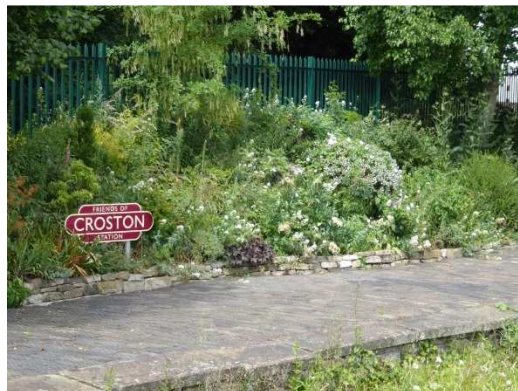
Floral displays at Croston

Croston: The Friends of Croston station continue to make the station environs extremely attractive. As the judges commented in the 'It's Your Neighbourhood Awards' "The Friends Group are involved in ensuring that the station is being maintained to a very high standard. The station is a credit to all concerned". One can only agree.