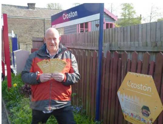
Launching Make A Bee Line at Croston Station on the 17 th April, 2019

This is a marketing initiative for the Preston to Ormskirk line and the attractive leaflet is designed to encourage greater use of this vital local service and encourage visitors to use the train to visit Croston Village, Rufford Old Hall, walk along the Rufford Branch of the Leeds – Liverpool Canal or take the path from Burscough Bridge station, a short walk from Burscough Junction, to Martin Mere.