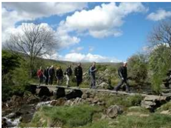
A DalesRail guided walk at Austwick Beck