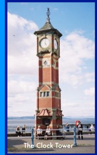
The Clock Tower

OS map: © Crown copyright Lancashire County Council licence № 100023320