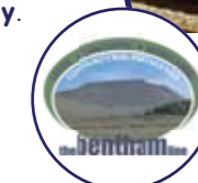
Passing Ingleborough

A spectacular 75-mile journey from Leeds in the industrial heartland of West Yorkshire , passing through the magnificent Yorkshire Dales , skirting the Forest of Bowland AONB and on to the picturesque shores of Morecambe Bay .