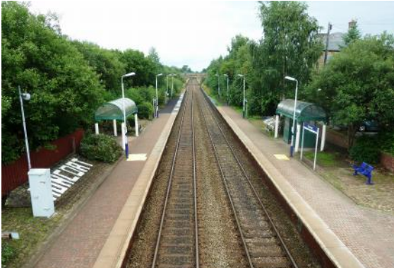
Huncoat Station - August 2010

Spread out over the five Lancashire CRPs are a number of stations that have been adopted by Friends of Stations groups. The groups work closely with the Community Rail Development Officers and are recognised by Northern Rail and Network Rail. Currently the stations with friends groups are: Ansdell & Fairhaven, Bentham, Bescar Lane, Blackburn, Brierfield, Burscough Bridge & Junction, Church & Oswaldtwistle, Clitheroe, Colne, Crompton, Darwen, Entwistle, Huncoat, Langho, Meols Cop, Nelson, Ramsgreave & Wilpshire, Rishton, St. Annes-on-the-Sea, Squires Gate & Whalley.