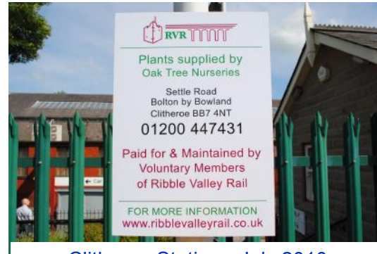
Clitheroe Station - July 2010

The stations along the Clitheroe Line and the West Lancs lines and those at Colne and Rishton continue to have superb flower displays and in some areas Parish Councils have helped with funds for the purchase of bedding plants and compost. The groups are also happy to help publicise nurseries that have supplied plants. All this is tempered though, by the continuing struggle against vandalism and litter louts at such places as Darwen and Entwistle.