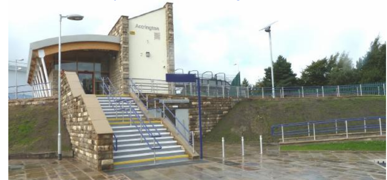
The newly completed Accrington Eco Station

The station hosted a visit on the 27 th July of UK rail professionals including representatives from the DfT, Network Rail, Northern Rail and Translink (the bus and train operator for Northern Ireland). Other visits are in the pipeline.