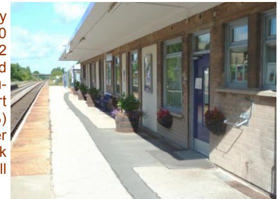
Bentham station - August 2010

The five Lancashire Community Rail Partnerships have around 120 regular volunteers working at 22 stations. Based on the figures used by ACoRP in its 'Value of Community Rail Volunteering' report (national minimum wage + 20%) and allowing that each volunteer spends around 1.5 hours a week on the station, this equates to well over £66,000 of support.