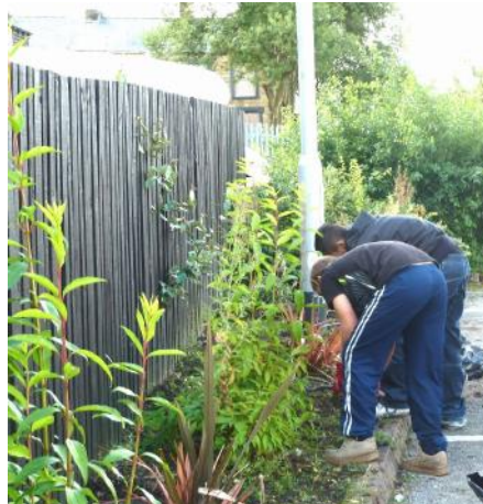
Brierfield station 18.08.10

The day went very well and we will look at taking this scheme forward at other local stations. More details of the community reparation scheme can be found below.