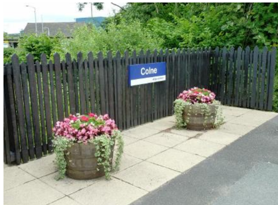
Colne Station - July 2010

The group at Nelson continues to do work cleaning up the station environment and are supported by staff from the Interchange. At Burscough Junction the group has seen a resurgence and work has commenced again on the disused platform helped by a group from the Community Payback scheme. Clitheroe has also had work done by the same type of group and Brierfield is also to benefit in a similar way with young people from the Burnley & Pendle Youth Offending Team carrying out Community Reparation work at the station.