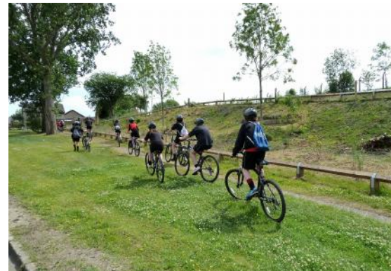
Cyclists on the Greenway on launch day