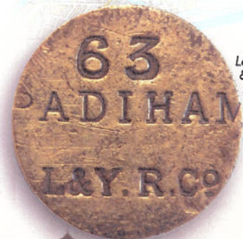
Lancashire & Yorkshire Railway Pay Check