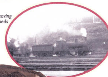
Engine leaving Rose Grove Sheds