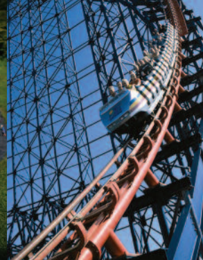
Pleasure Beach Resort