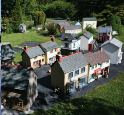
Blackpool Model Village & Gardens