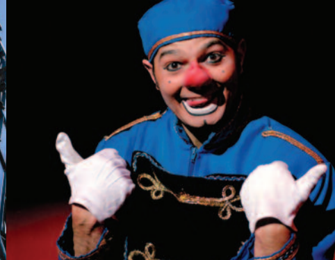
Blackpool Tower Circus

CENTRAL PIER BLACKPOOL 30 ride tokens on Central Pier for £20