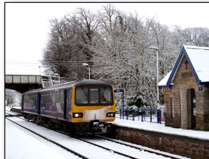
The 10.19 ex Leeds "The Boat Train" in Bentham Station on 5th January 2010.

Best wishes for Christmas and the New Year from the LASRUG Committee