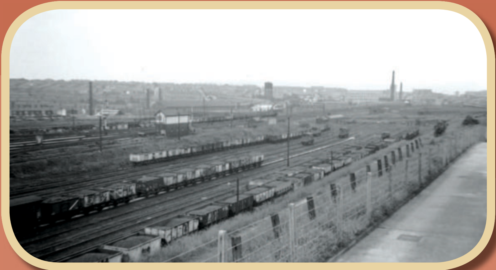
Rose Grove Yard