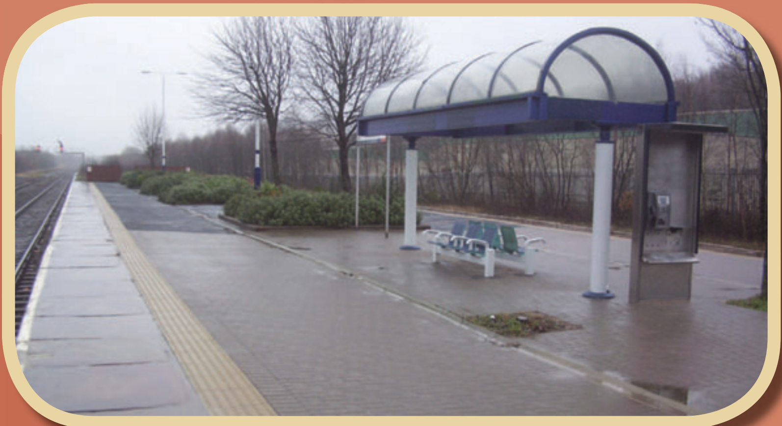
Rose Grove Station - November 2009