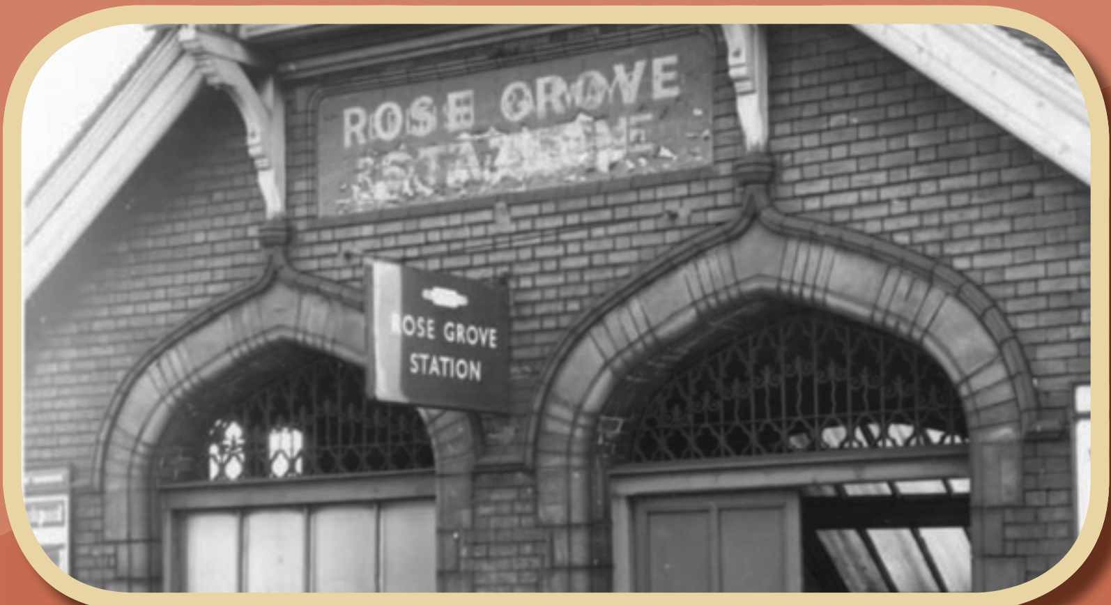
Rose Grove Station Entrance