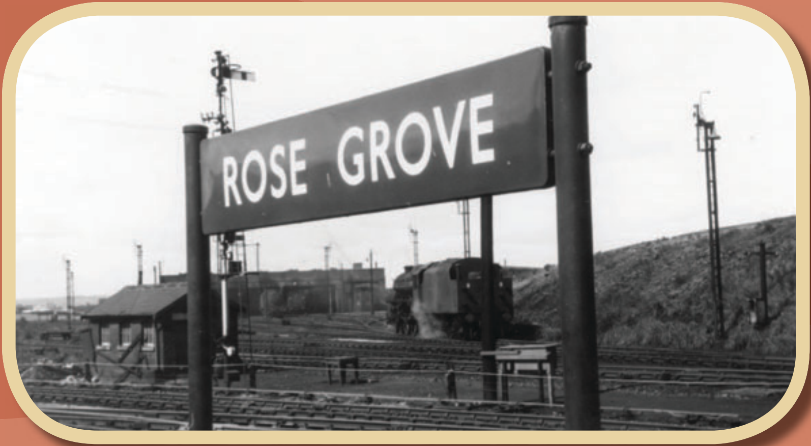
Rose Grove Station