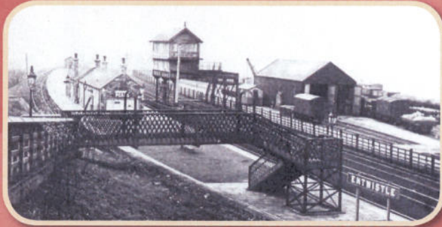
Entwistle circa 1903