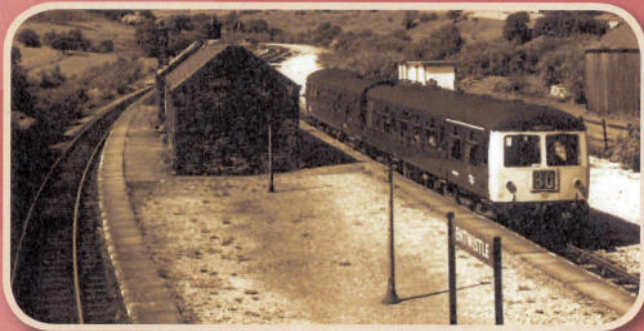
Entwistle 3rd July 1971