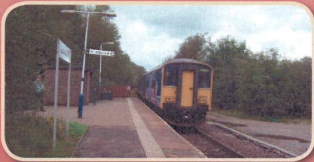
Entwistle 17th August 2007