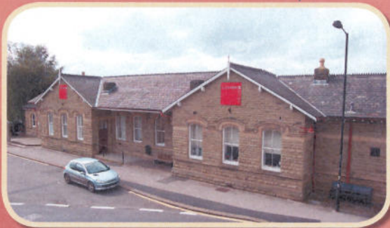
Clitheroe July 2008