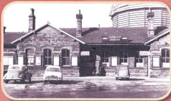
Clitheroe January 1960