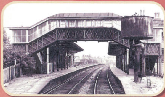
Clitheroe June 1964