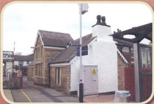
Bamber Bridge circa 2008