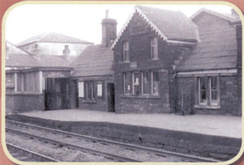
Bamber Bridge circa 1950s