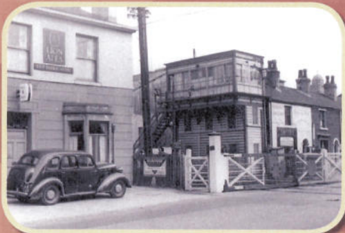
Bamber Bridge circa 1950s - photo courtesy Lancs & Yorks Railway Society